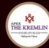
Siddhant Vihar, Ghaziabad