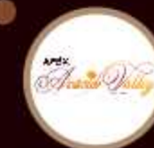
Sector 4 Vasahat, Ghaziabad